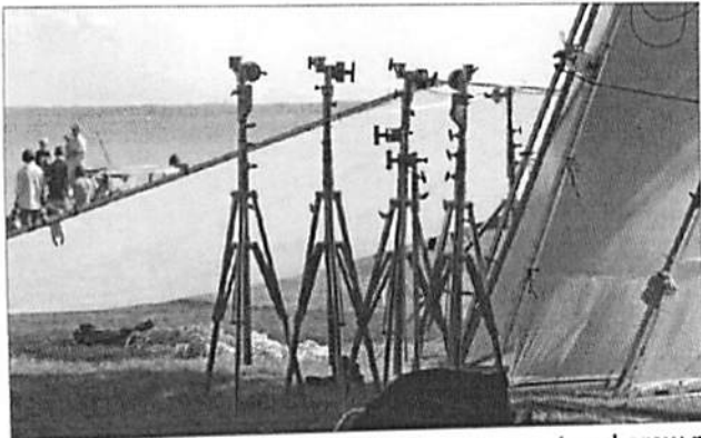
Some of the film equipment on the set as cast and crew prepare for filming.